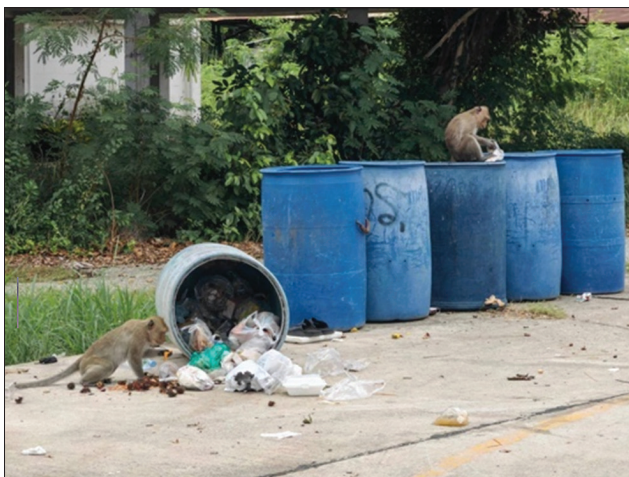
Figure 1: Free-ranging long-tailed macaques in the community, Bangphra, Si Racha, Chonburi, Thailand.

Macaques were captured using baited cages containing seasonal fruits, grains, and corn. These cages were strategically positioned across Bang Phra Subdistrict in Si Racha and around the Military Camp,