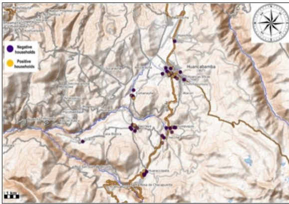
Figure 1: Distribution map of houses from which serological samples from pigs with (yellow) and without (purple) cysticercosis were obtained in localities of the José María Arguedas district, Andahuaylas, Apurímac, Perú, in 2024.